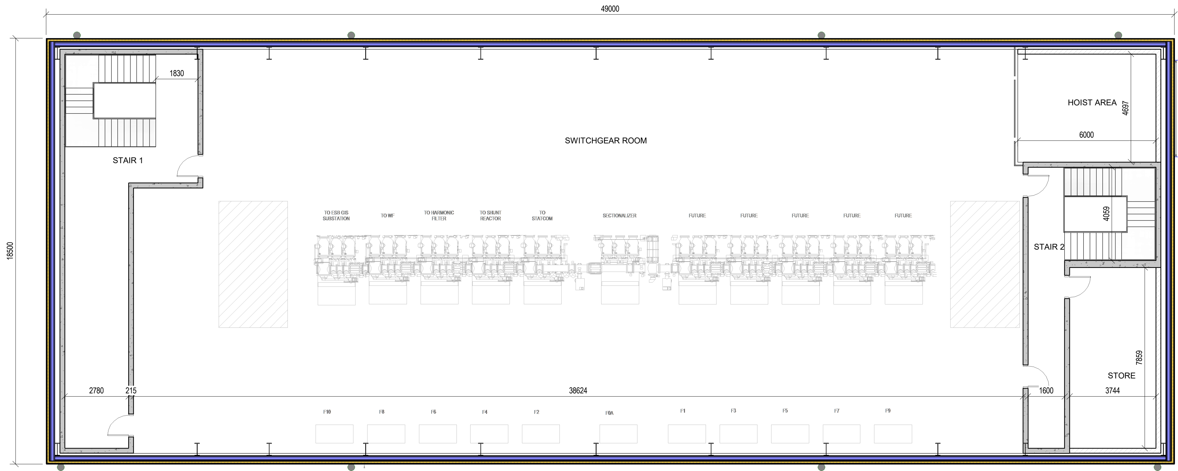
FIRST FLOOR GENERAL ARRANGEMENT